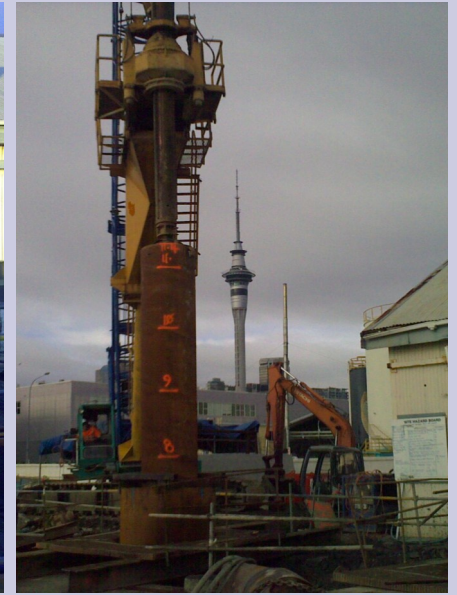
Screwing 900 dia casing with crane and drill table

The Sea and City Project is part of urban regeneration program being developed for the former Tank Farm area in Auckland.