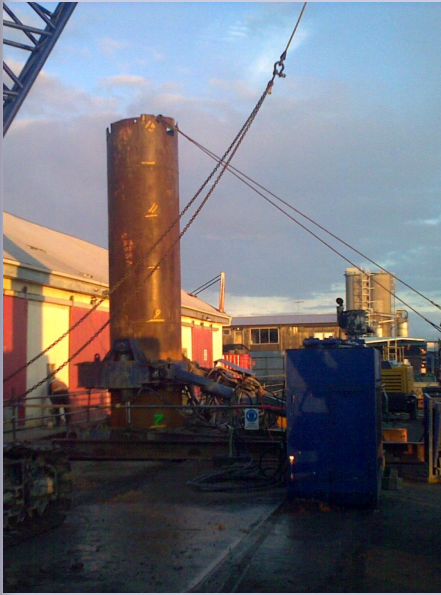
Oscillating 1500 dia Casing through the basalt